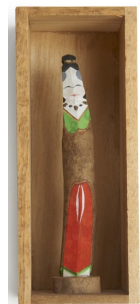
A doll made from a twig and paint